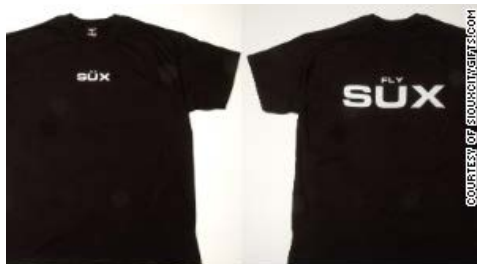
Fly Sux T-shirts are flying off the shelves.